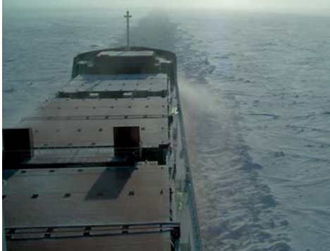
NORILSKIY NICKEL in Yenisey channel

Length 169.5 m Breadth 23.1 m Draught 9.0 m Power 13000 kW The vessel has one 13 MW Azipod unit and ice class is LU 7. The vessel left Aker Yards Helsinki shipyard for ice trials on March 3, 2006.