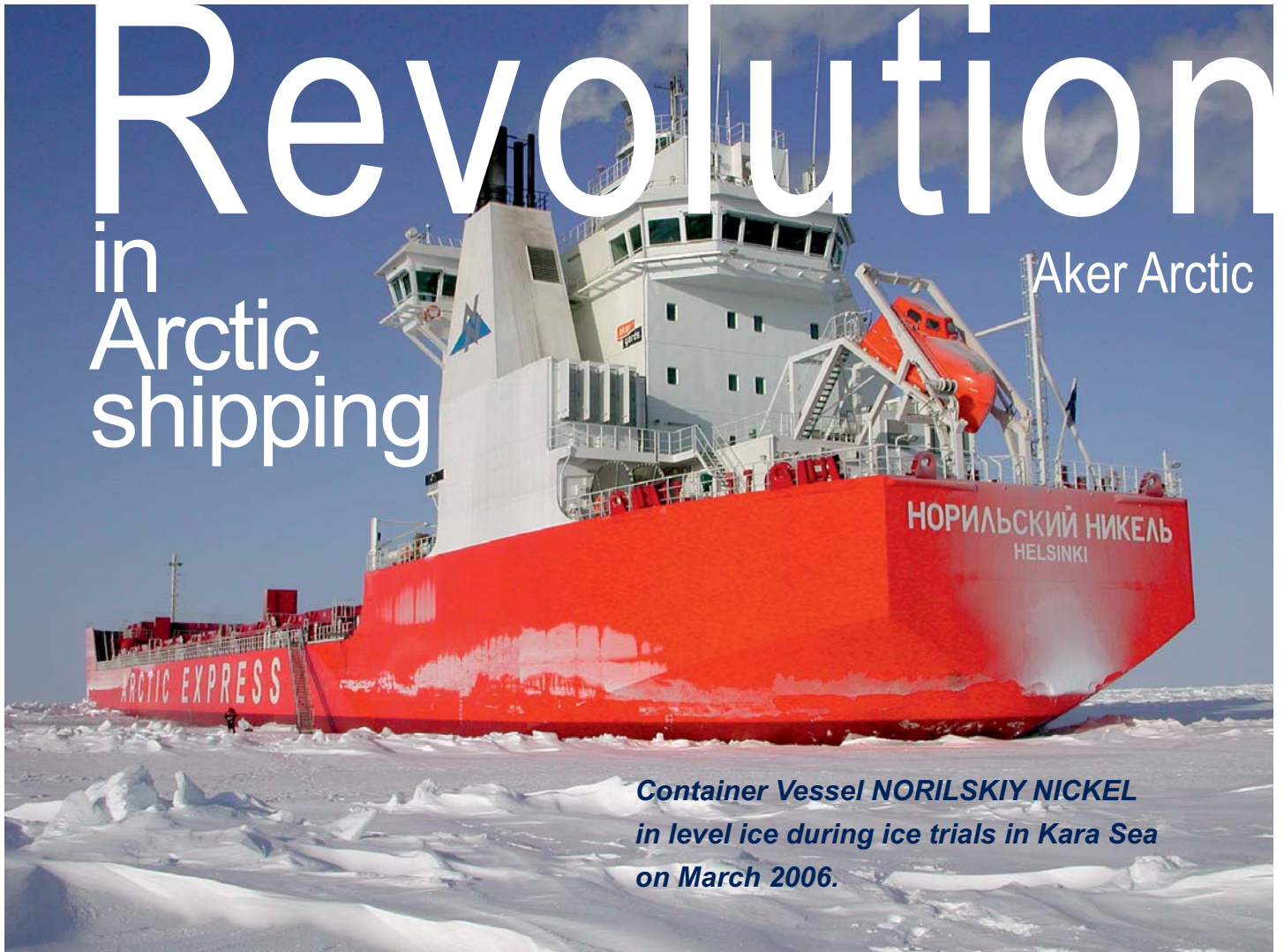
Container Vessel NORILSKIY NICKEL in level ice during ice trials in Kara Sea on March 2006.