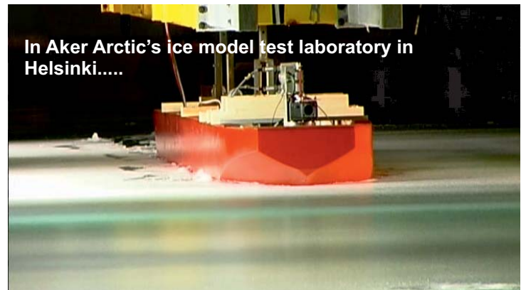
In Aker Arctic's ice model test laboratory in Helsinki.....

The new vessel is a prototype for a series of five which are to replace the current SA-15 type vessels that have been in successful use for the last twenty years. These vessels were built in Finland by Wärtsilä and Valmet shipyards in the 1980's. Aker Yards Helsinki yard built Norilskiy Nickel, and delivered her in early 2006.